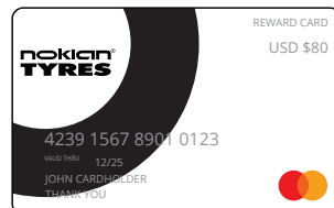
Illustration of the prepaid card as an example only. The received card can be different from that represented here.

To check the status of your claim, visit: www.nokiantyresrebates.com